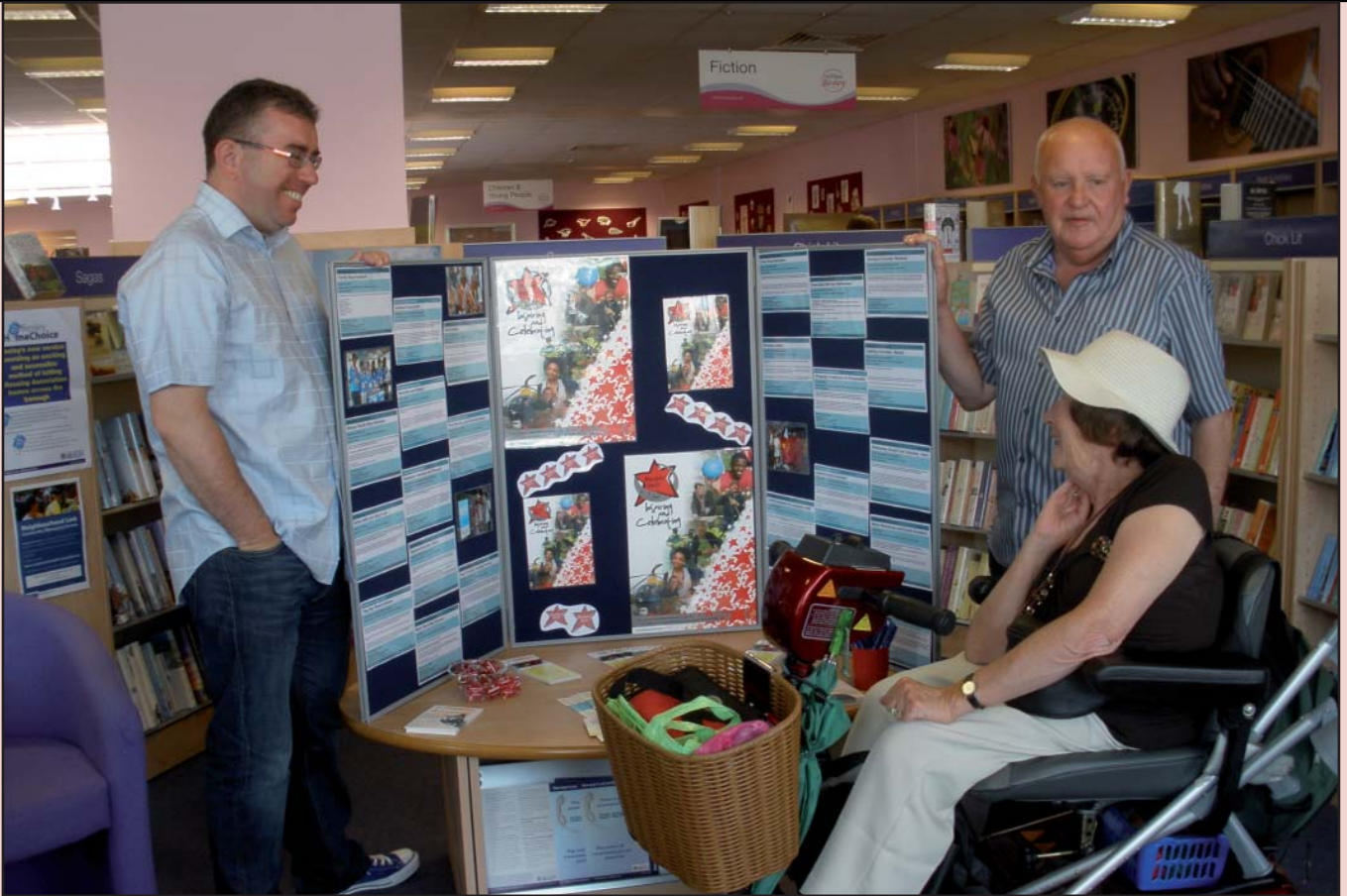
Above: Volunteers' Week 2010