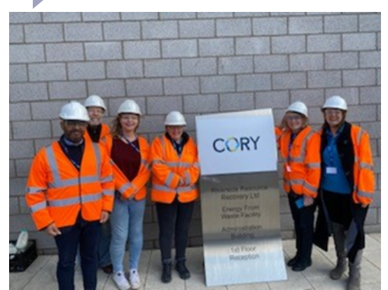
Visit to Funder combined with training